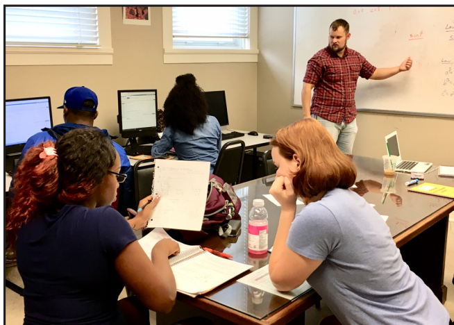
Math Lab Tutoring