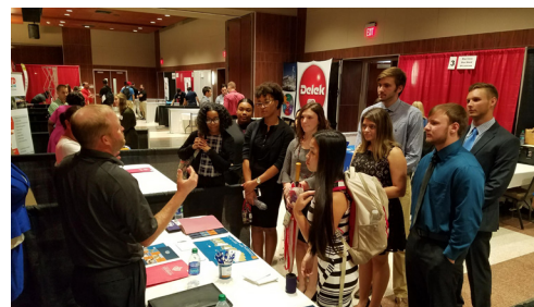
Freshmen students attended the UL Career Fair in September.

A MINOR — The University offers students a wide variety of minors that enrich their course of study while completing their undergraduate degree. Minors may expand a student's knowledge and skills in an area that increases preparation for a particular career. Other students may choose to enroll in a minor simply to learn more about an area of personal interest. One of the most popular minors offered by the university is a Leadership Studies minor . The Leadership Studies minor became available in Spring 2014, and is available to students of any major. The minor was student-developed with the goal of creating well rounded students who can communicate effectively. Freshmen wishing to declare a minor must go to Academic Success Center in Lee Hall, room 115. Click here to see a full list of minors offered at UL Lafayette.